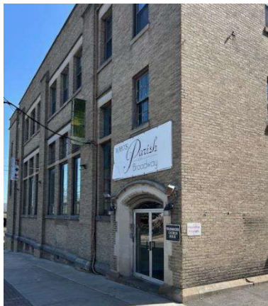
The church housing the Recreation Center